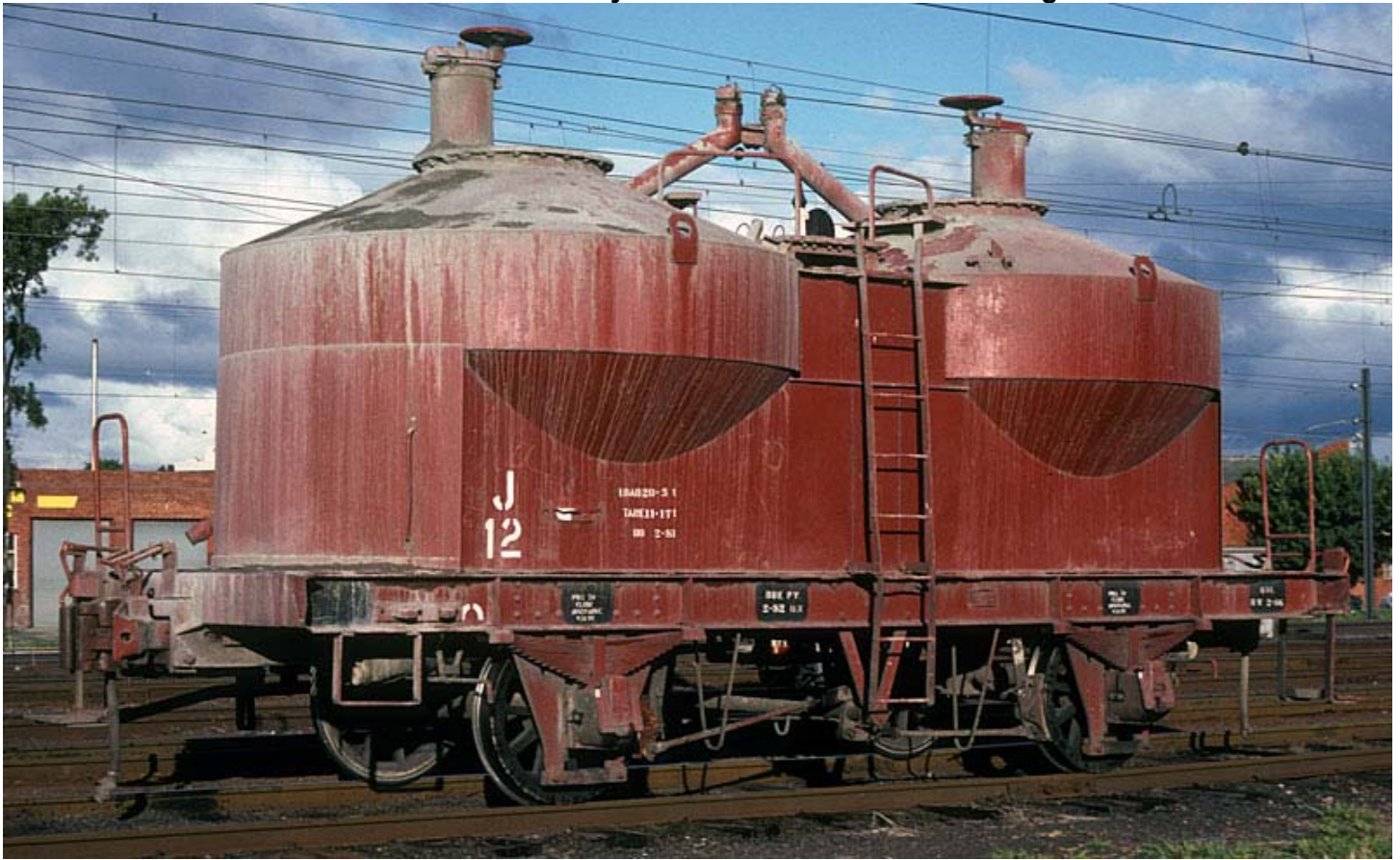
J 12 at Dandenong, Nov 16 1981

Basic history notes: The J cement wagons started life as a mixed group. Originally built in 1949-1952 to haul pulverized brown coal, they were coded "X." Later, they were converted to carry flour and then cement, depending on their size. Their code was changed to "J" because "X" was already used for a standard gauge bogie exchange system.